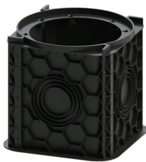
POB 30 NEW WIRING POTHOLE

-3 MONTH OPERATION BETWEEN CHARGE -RECHARGE FROM SOLAR PANEL WITH ONLY 20% OUTPUT